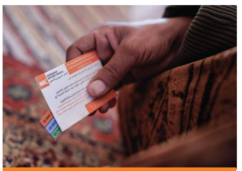
A Syrian woman holds an information card given to refugees by NRC's ICLA team in an informal tented settlement in the Bekaa Valley, Lebanon.

'In general, most of the hospitals contacted reported that the cases of refugees whose medical care is not covered by UNHCR or UNRWA, would be